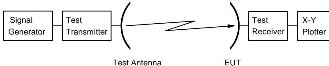
Figure 3: Test arrangement - antenna receive pattern measurement